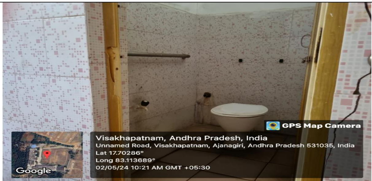
Way to Accessible Toilets

Visakhapatnam, Andhra Pradesh, India Unnamed Road, Visakhapatnam, Ajanagiri, Andhra Pradesh 531035, India Lat 17.70286° Long 83.113689° 02/05/24 10:21 AM GMT +05:30